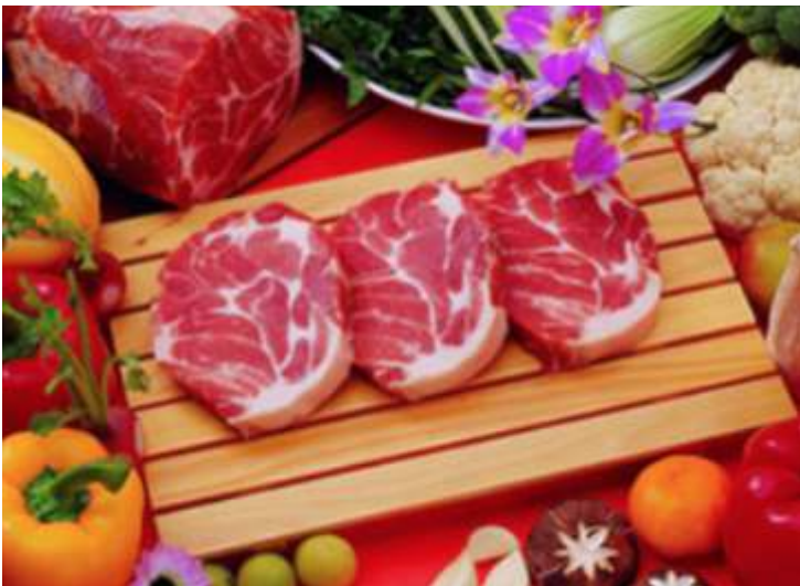
HIGH CRI = 80