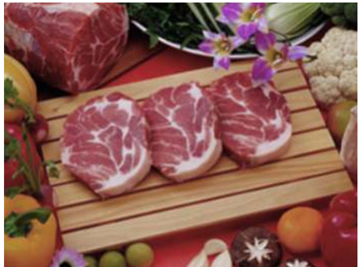
LOW CRI >50